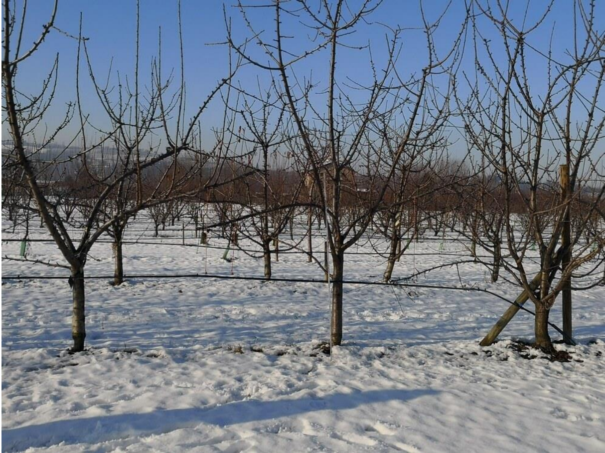
Image 2: Plants grafted onto Weigi® 1, center, onto Weigi® 2, left, and MaxMa® 60, right.

Weigi® 2 in the central European climate and on light soils shows slightly higher growth than Gisela® 5. The production yield is like that of Gisela® 5, but the fruit size is slightly larger. In very hot weather, the fruit of trees grafted on Weigi® 2 shows a tightness of maturity compared to those grafted on Gisela® 5. It has very good compatibility with current cherry varieties.