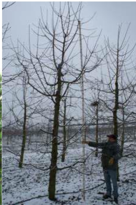
Regina Weigi®3, 9 th leaf