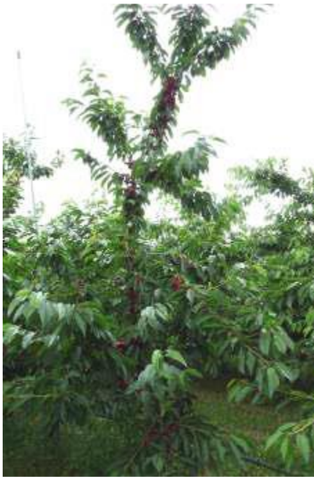
Regina Weigi®3, 6 th leaf

Weigi®3 and Weigi®4 are recommend in central-north Europe for replanting with limited access to water and in hot and dry climates these rootstocks are worth to plant on commercial base.